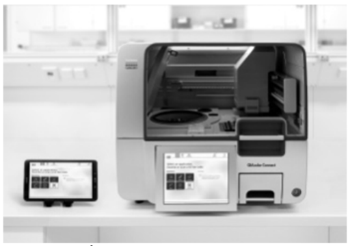
Figure 1. QIAcube Connect.

QIAcube instruments are preinstalled with protocols for purification of plasmid DNA, genomic DNA, RNA, viral nucleic acids, and proteins, plus DNA and RNA cleanup. The range of protocols available is continually expanding, and additional QIAGEN protocols can be downloaded free of charge at www.qiagen.com/qiacubeprotocols .